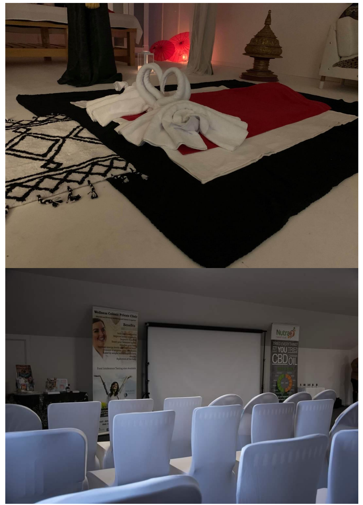
for future reference .

Also noted the alcohol selling times for future plans within the business, if a fresh farm shop tea room is requierd we can sell fine ales and wines to individuals for retail so these hours are required